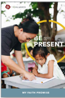
KIDS FAITH PROMISE CARDS English only