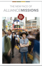
ALLIANCE MISSIONS (SAMPLE BROCHURE) English only