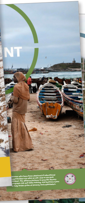
THEME POSTER 2