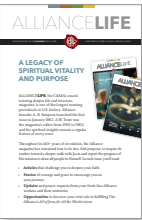
ALLIANCE LIFE SUBSCRIPTION FLYER English only