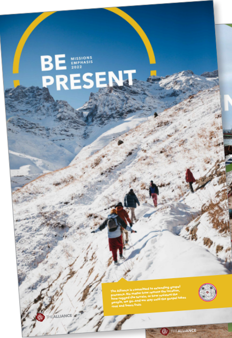
THEME POSTER 1

It’s more than posters on the church wall and an international potluck. It’s a deeply held Alliance value. It’s what sets us apart as a Christ-centered, Acts 1:8 family. It’s the DNA Jesus breathed into us when He called us to join Him in completing The Great Commission.