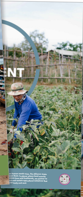
THEME POSTER 3