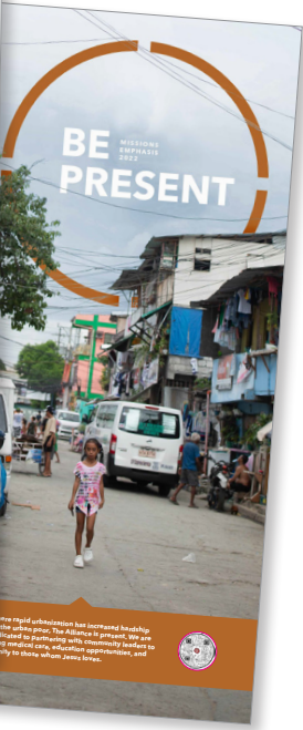
THEME POSTER 4